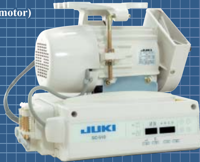
SC-510 (control box)