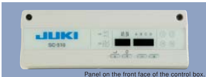
Panel on the front face of the control box.